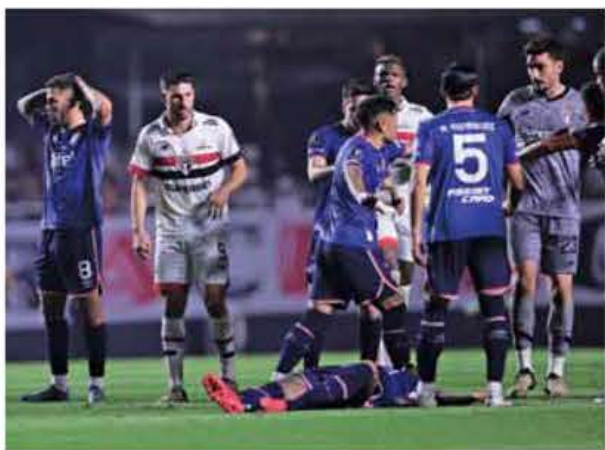
Uruguayan national team players were among those expressing their condolences. "Pain, sadness, it is hard to explain," Inter Miami striker Luis Suarez said. "May he rest